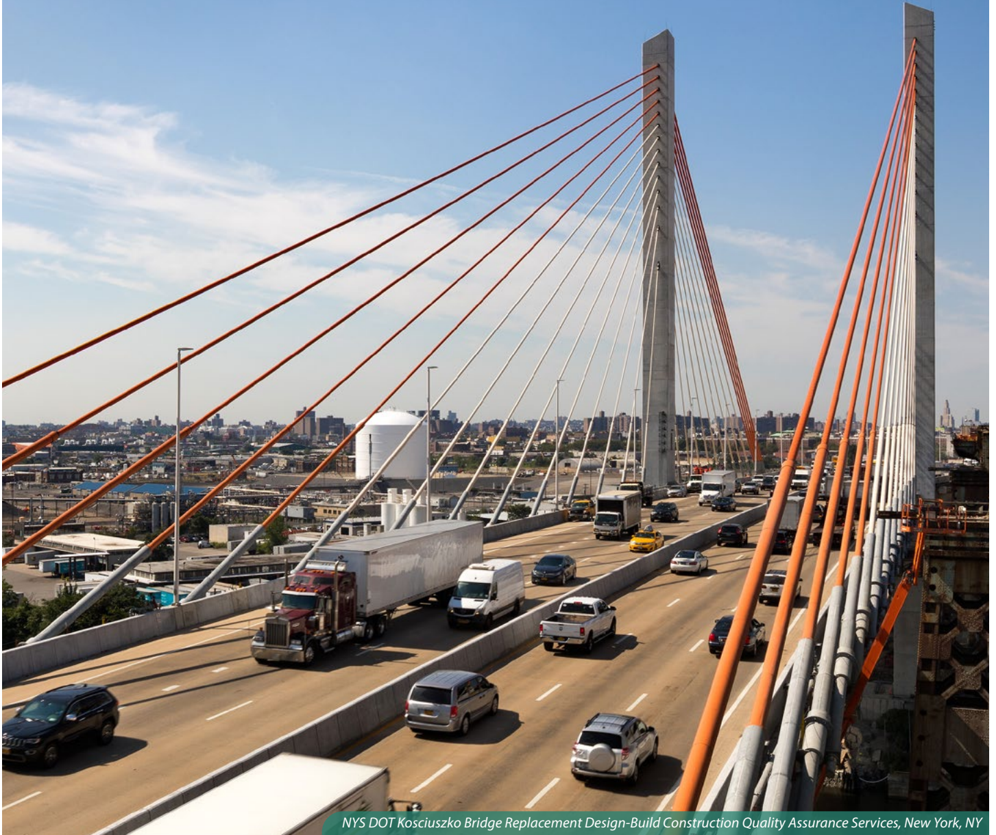
NYS DOT Kosciuszko Bridge Replacement Design-Build Construction Quality Assurance Services, New York, NY