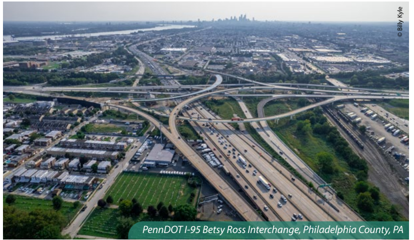
PennDOT I-95 Betsy Ross Interchange, Philadelphia County, PA