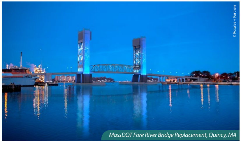
MassDOT Fore River Bridge Replacement, Quincy, MA

STV designs fixed and movable, long-span, and complex bridges of all types for highway and rail clients across the United States. We also provide condition inspection, resident engineering, rehabilitation and construction support services across the same project spectrum. For existing bridges in need of rehabilitation or replacement, STV has bridge specialists with expertise in load rating and modeling, fatigue analysis, seismic analysis, geotechnical studies, and non-destructive testing, as well as scour analysis and scour mitigation. With an extensive portfolio of various bridge types, we have the capacity to deliver bridge engineering of the highest quality.