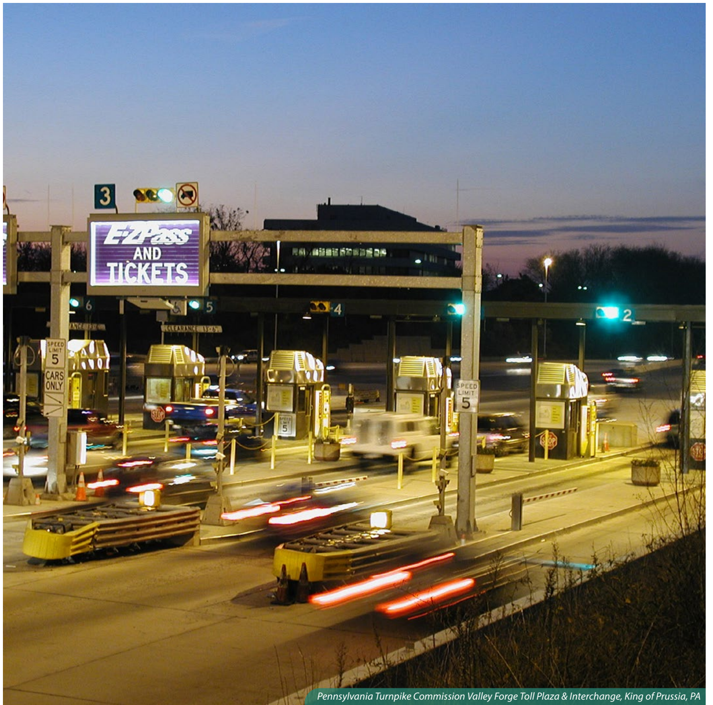
Pennsylvania Turnpike Commission Valley Forge Toll Plaza & Interchange, King of Prussia, PA