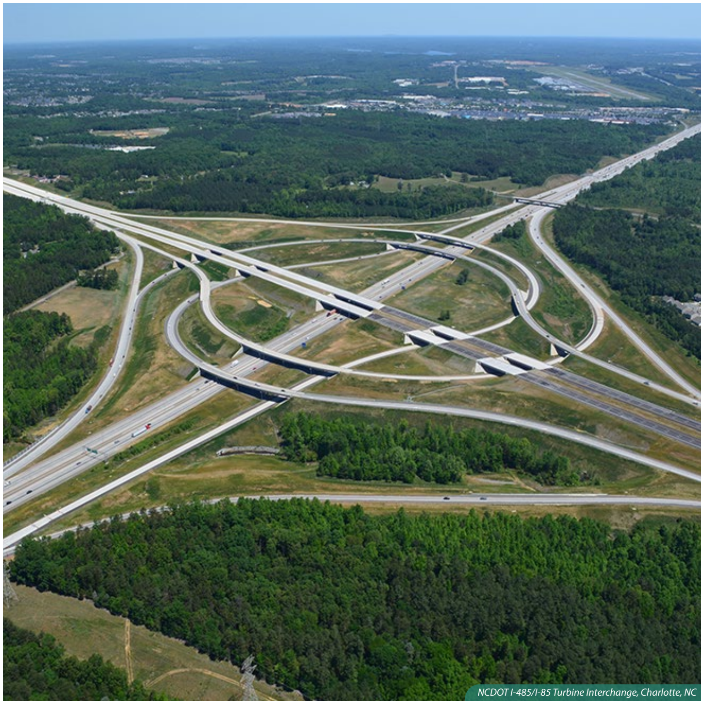
NCDOT I-485/I-85 Turbine Interchange, Charlotte, NC