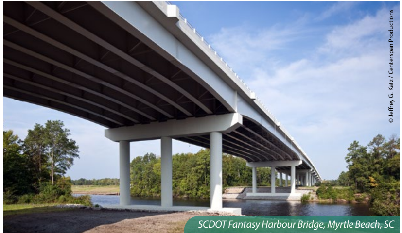
SCDOT Fantasy Harbour Bridge, Myrtle Beach, SC