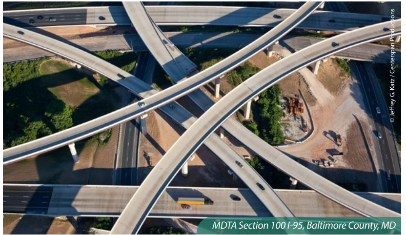
MDTA Section 100 I-95, Baltimore County, MD