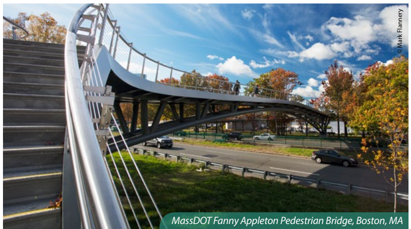
MassDOT Fanny Appleton Pedestrian Bridge, Boston, MA