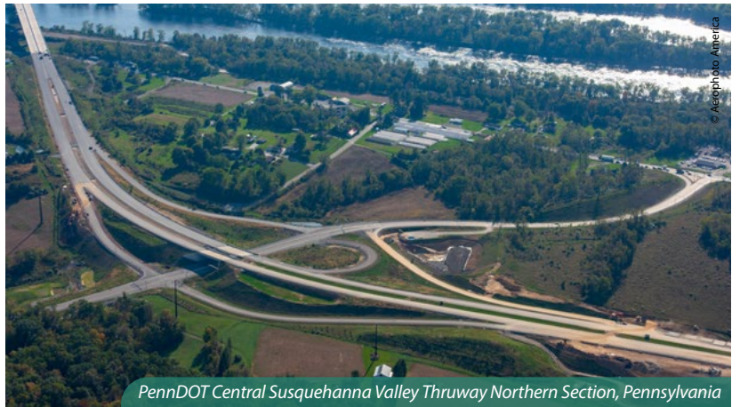
PennDOT Central Susquehanna Valley Thruway Northern Section, Pennsylvania