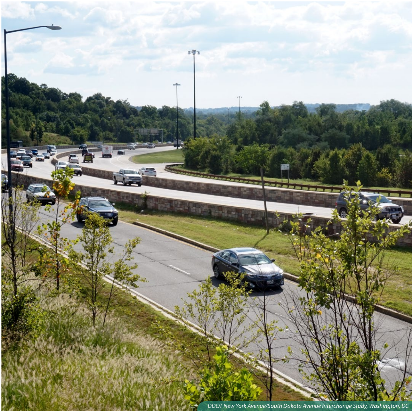
DDOT New York Avenue/South Dakota Avenue Interchange Study, Washington, DC