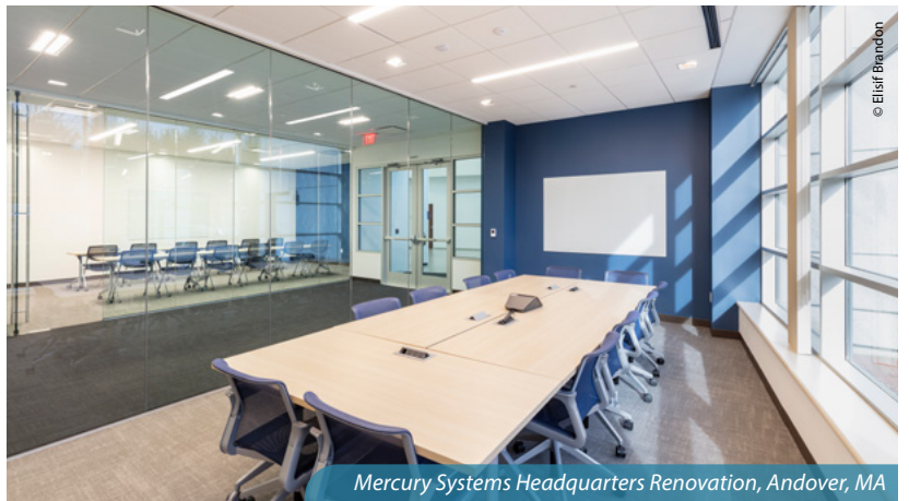
Mercury Systems Headquarters Renovation, Andover, MA