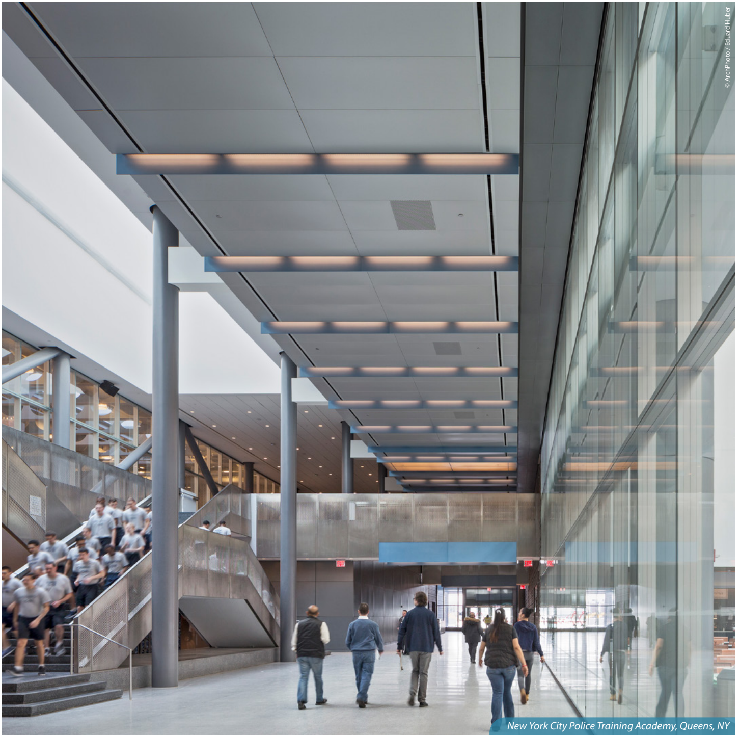
New York City Police Training Academy, Queens, NY