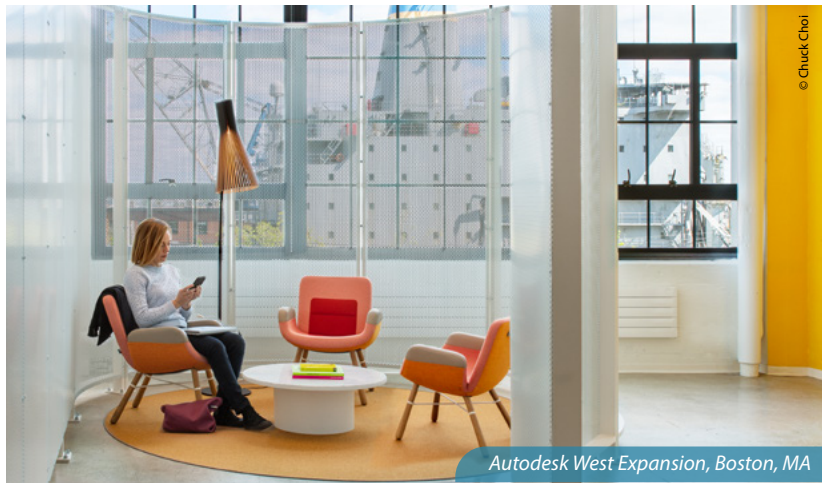
Autodesk West Expansion, Boston, MA

Our private sector clients operate on tight deadlines and need their facilities up and running as quickly as possible. At the same time, the construction of these facilities can't interfere with the productivity of the client's business. With decades of experience serving the commercial and industrial industries, we can plan and implement early procurement or design-build delivery methods to meet the strict deadlines of our clients.