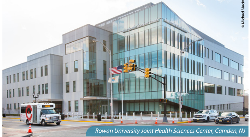
Rowan University Joint Health Sciences Center, Camden, NJ