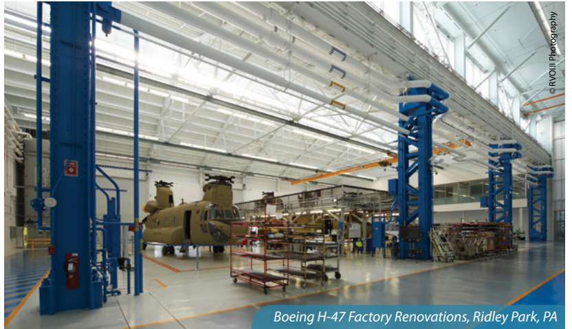
Boeing H-47 Factory Renovations, Ridley Park, PA