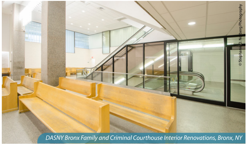
DASNY Bronx Family and Criminal Courthouse Interior Renovations, Bronx, NY

To better manage budgets and schedules for government agencies and our other public sector clients, we employ reporting tools that are open and transparent during all project phases. In managing these high-visibility projects, STV also works closely with facility end users and project stakeholders to minimize disruptions. These buildings often have unique security demands, as they are traditionally open around the clock and require varying levels of security at different times of the day. Additionally, safety and ADA accessibility are important factors for all facility occupants during and after construction.