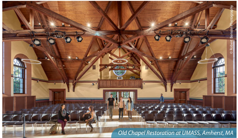
Old Chapel Restoration at UMASS, Amherst, MA

Since a campus is a unique setting with students present year-round, we work to minimize disruptions to their academic and residential life.