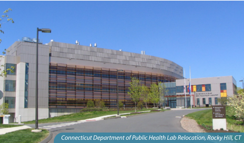
Connecticut Department of Public Health Lab Relocation, Rocky Hill, CT

Healthcare and research facilities require extensive collaboration early on between medical and research staff, planners and designers, and the project management team. STV has been involved in new construction, renovation and expansion of inpatient and outpatient facilities, clinical research and research and diagnostic laboratories. As a result, we are familiar with the specialized requirements of ICUs, CCUs, BSL2, BSL3, and BSL3-Ag laboratories, vivariums, emergency rooms and other types of facilities. We have successfully addressed the many issues unique to healthcare and research facilities, such as biosecurity, containment, commissioning, and certification.