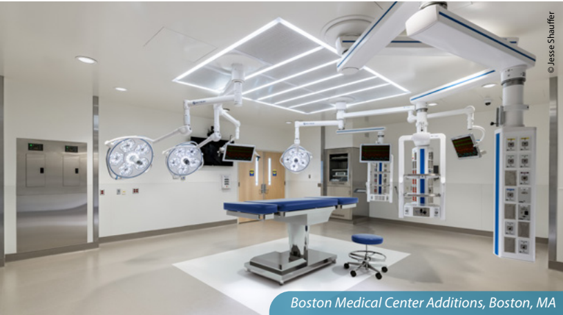
Boston Medical Center Additions, Boston, MA