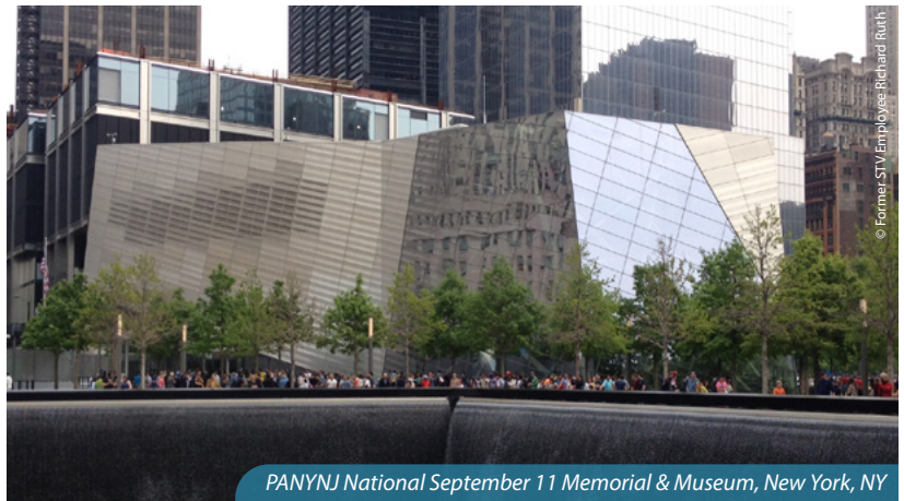
PANYNJ National September 11 Memorial & Museum, New York, NY