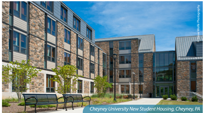
Cheyney University New Student Housing, Cheyney, PA