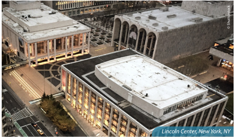
Lincoln Center, New York, NY