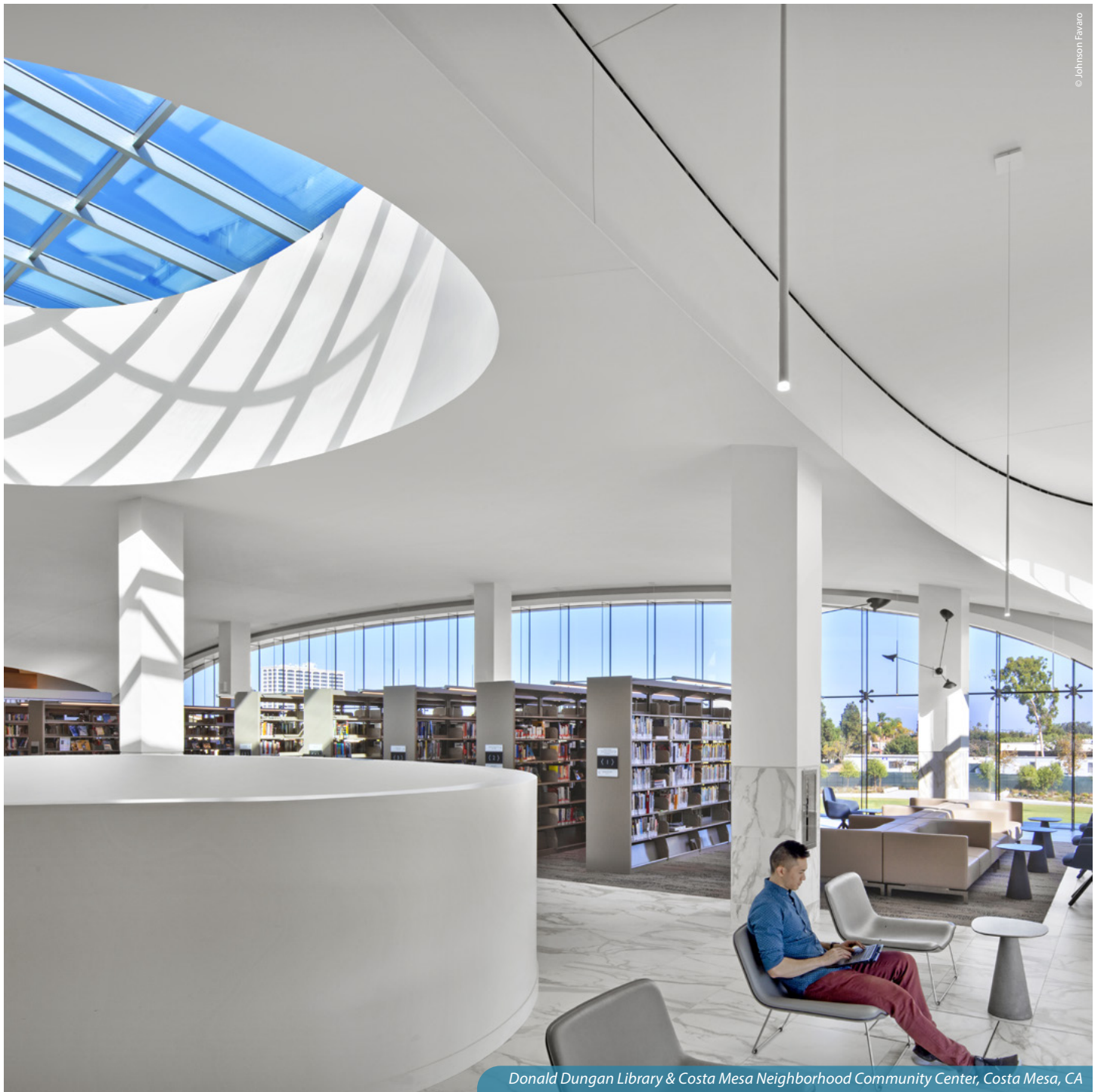
Donald Dungan Library & Costa Mesa Neighborhood Community Center, Costa Mesa, CA