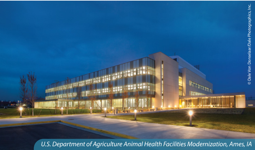
U.S. Department of Agriculture Animal Health Facilities Modernization, Ames, IA