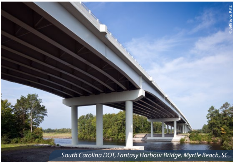
South Carolina DOT, Fantasy Harbour Bridge, Myrtle Beach, SC