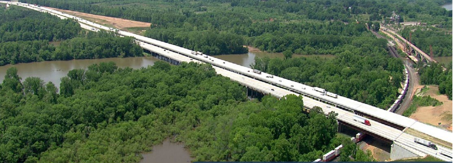
North Carolina DOT, I-85 over the Yadkin River Design-Build, Rowan and Davidson Counties, NC