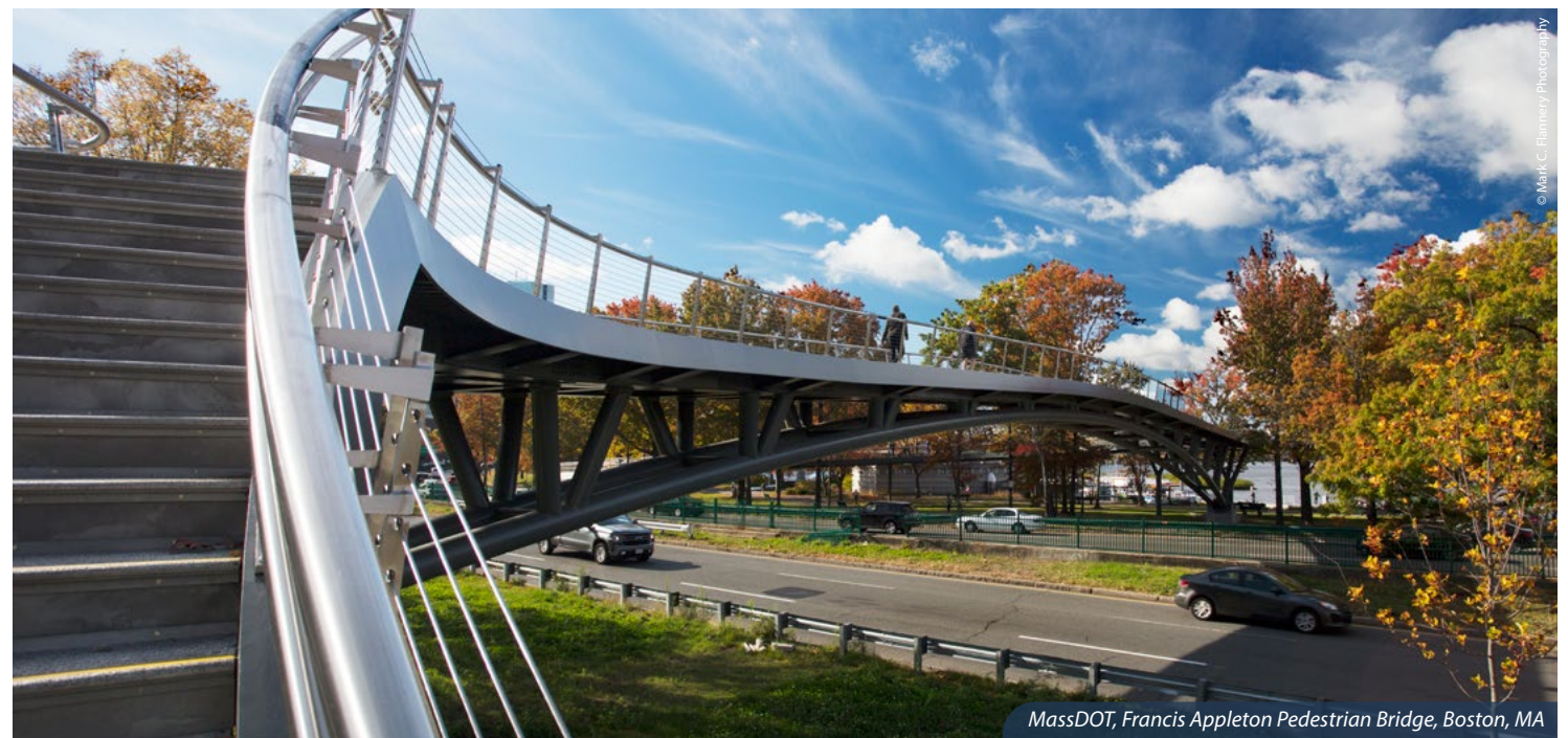
MassDOT, Francis Appleton Pedestrian Bridge, Boston, MA