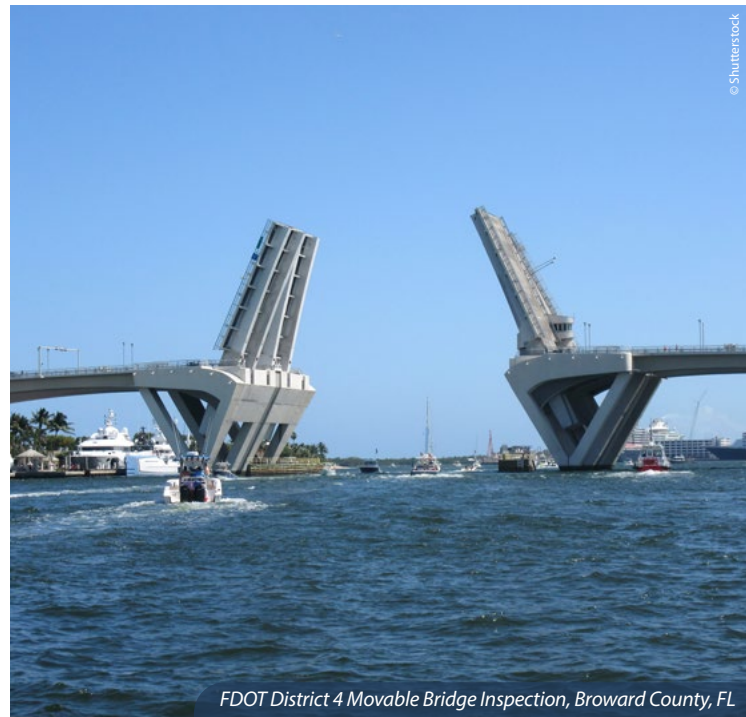
FDOT District 4 Movable Bridge Inspection, Broward County, FL