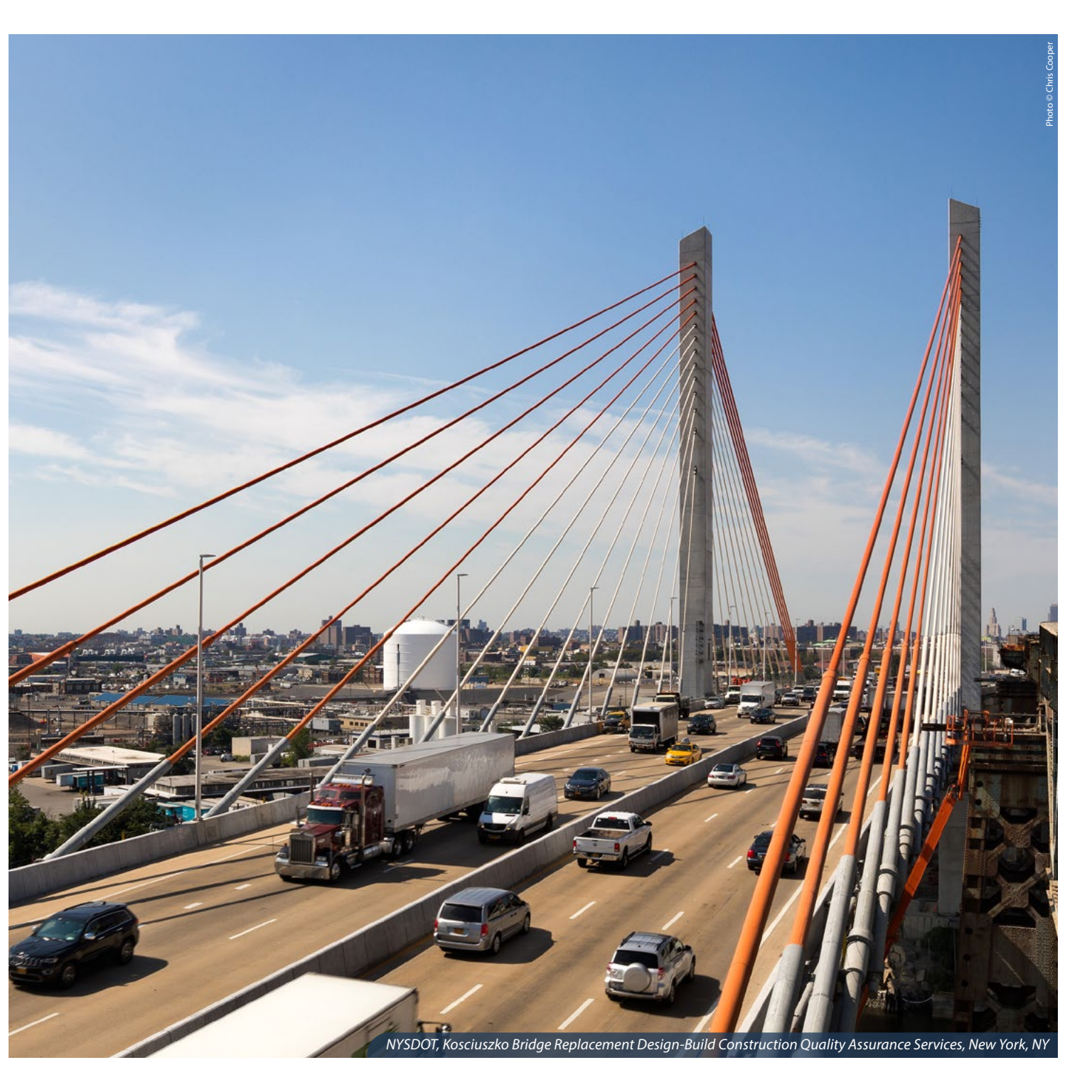
NYS DOT, Kosciuszko Bridge Replacement Design-Build Construction Quality Assurance Services, New York, NY