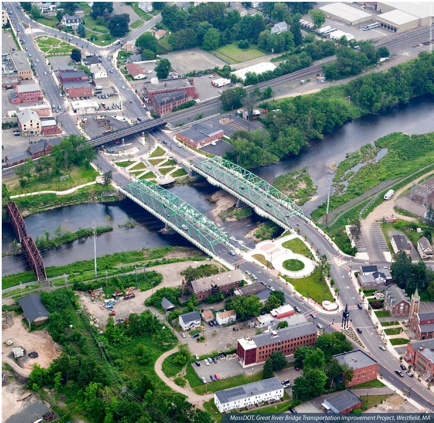
MassDOT, Great River Bridge Transportation Improvement Project, Westfield, MA