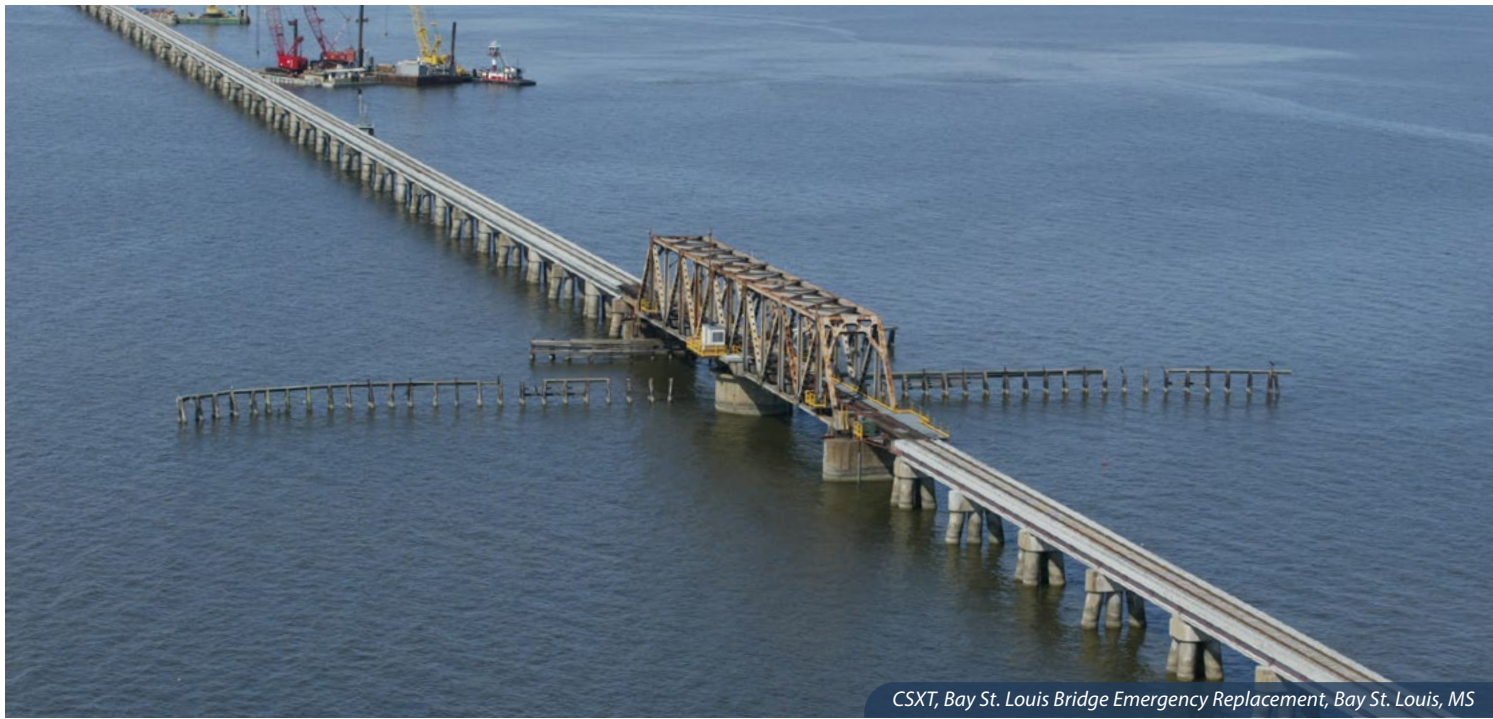
CSXT, Bay St. Louis Bridge Emergency Replacement, Bay St. Louis, MS