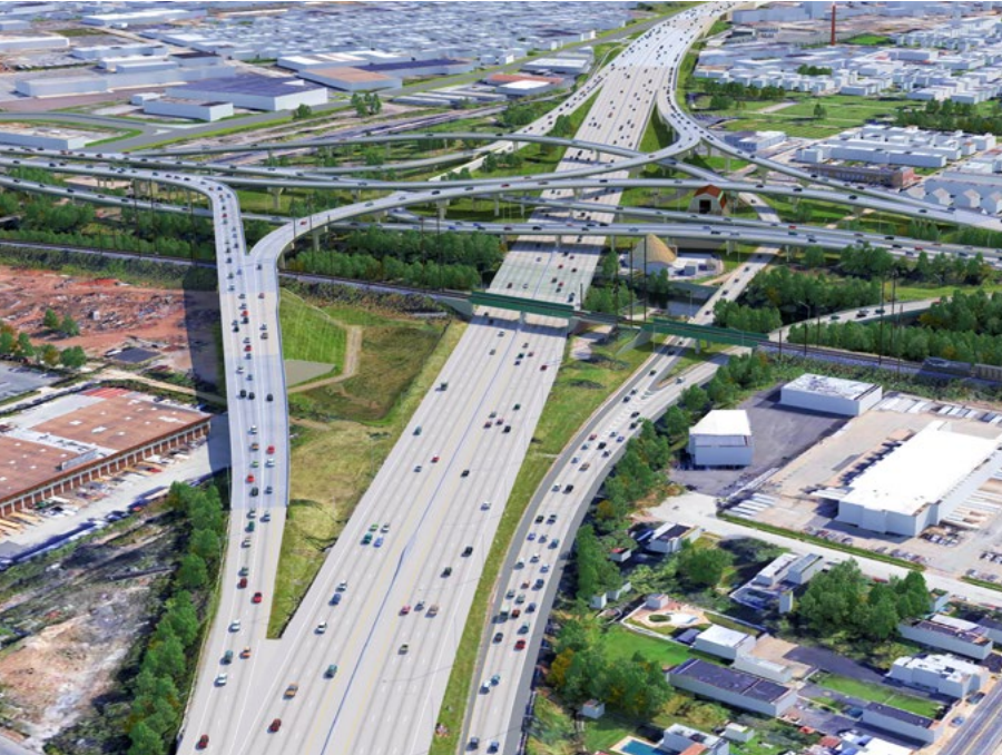
PennDOT, I-95 Section BRI – Betsy Ross Interchange Reconstruction, Philadelphia, PA