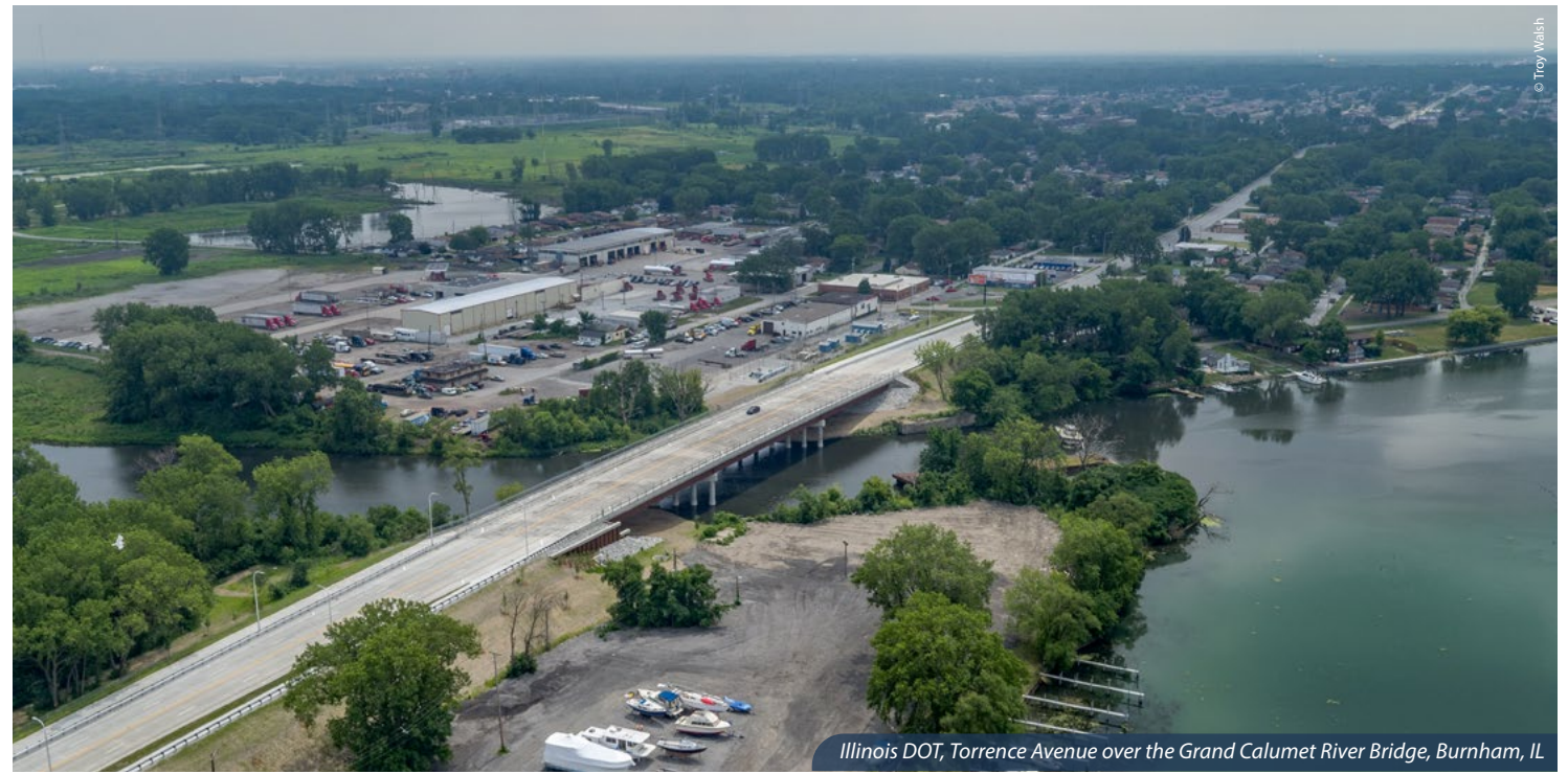
Illinois DOT, Torrence Avenue over the Grand Calumet River Bridge, Burnham, IL