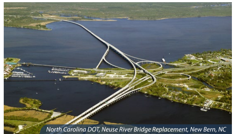
North Carolina DOT, Neuse River Bridge Replacement, New Bern, NC