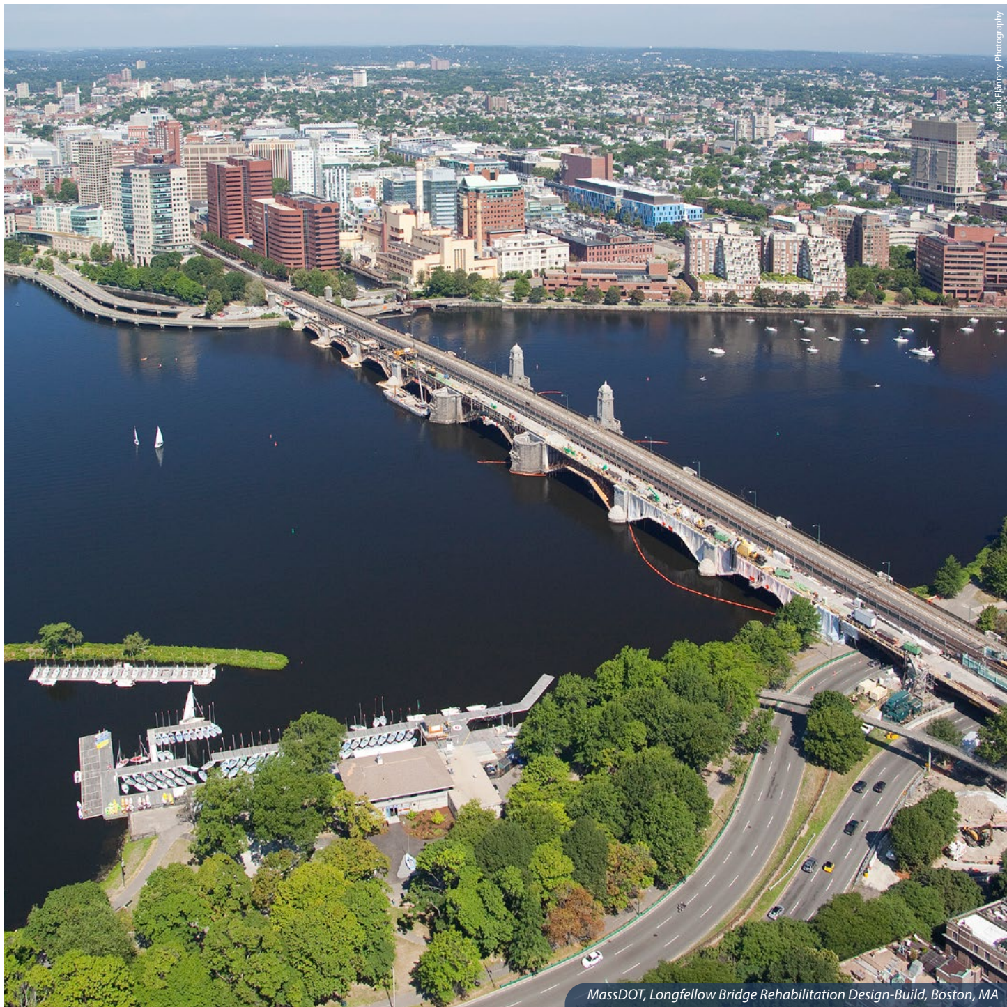
MassDOT, Longfellow Bridge Rehabilitation Design-Build, Boston, MA