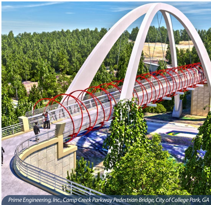
Prime Engineering, Inc., Camp Creek Parkway Pedestrian Bridge, City of College Park, GA