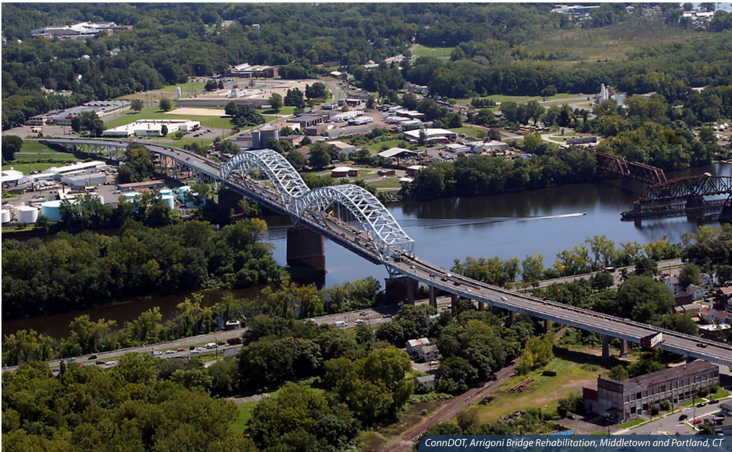
ConnDOT, Arrigoni Bridge Rehabilitation, Middletown and Portland, CT