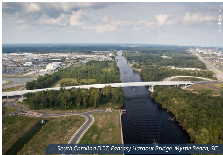
South Carolina DOT, Fantasy Harbour Bridge, Myrtle Beach, SC