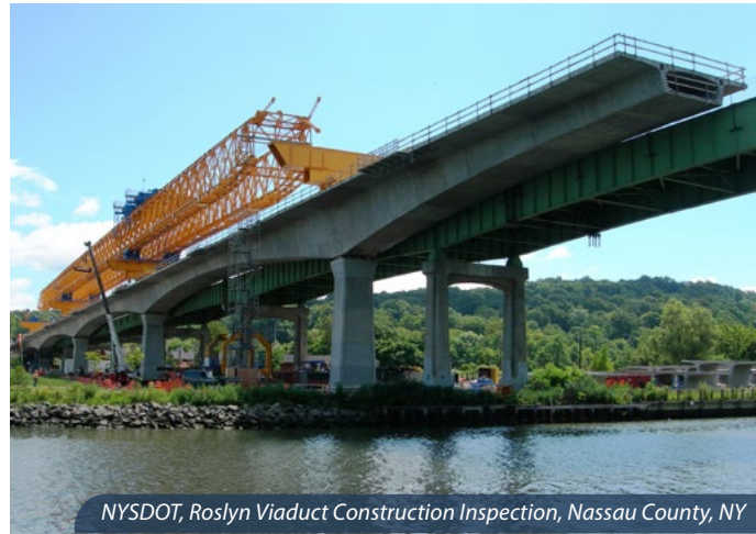
NYS DOT, Roslyn Viaduct Construction Inspection, Nassau County, NY