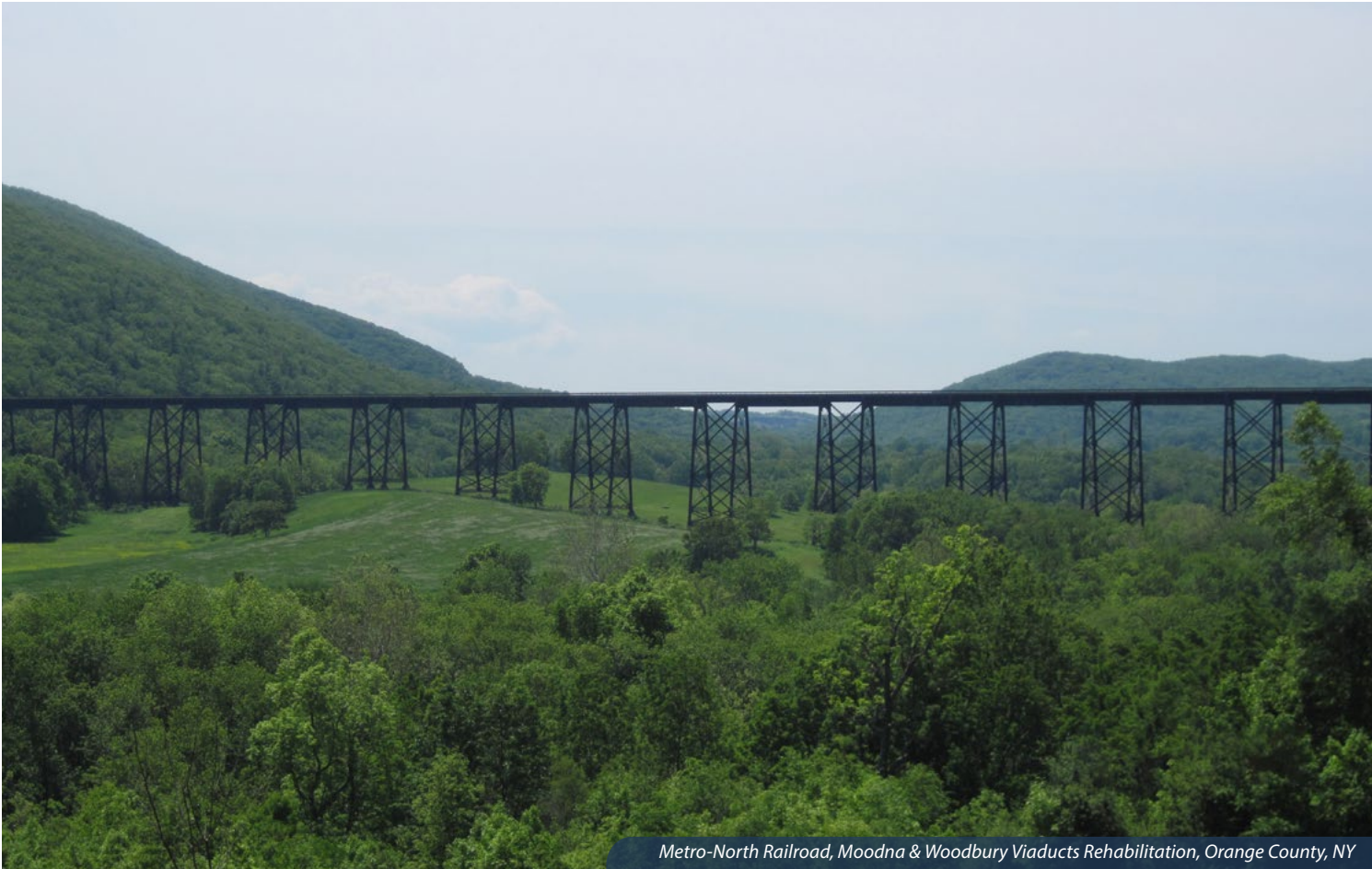
Metro-North Railroad, Moodna & Woodbury Viaducts Rehabilitation, Orange County, NY